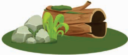
under logs and stones

A microhabitat is a small area with different conditions to the surrounding area.