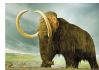
Woolly mammoth (extinct)