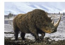
Woolly rhino (extinct)